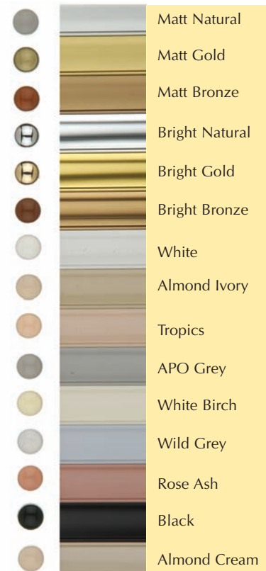
Special colours available on request.