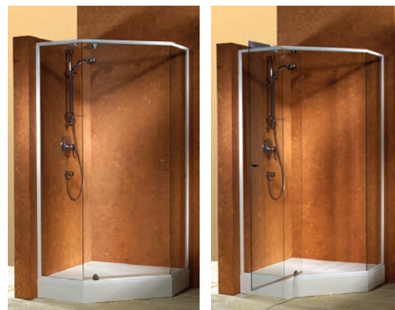
Over 180° of door swing is possible, enabling both inward and outward opening if required, providing maximum use of bathroom area.

The 'lowering' effect of the design automatically reduces the gap between door and sill on door closure, which further assists with the minimisation of external splashing and improved water resistance.